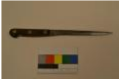
Knife (1998.16.4) February 27, 2013, 1930 – 1940