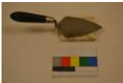
Paperweight (2003.57.2) May 17, 1964,