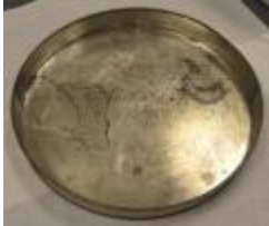
Mold, Cake (2007.3.19) Angelo's Bakery