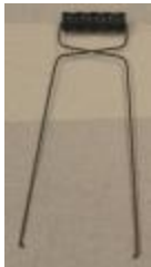
Fryer Hook Set (2007.3.11.A) Angelo's Bakery