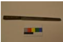
Knife (1998.16.8) February 27, 2013, 1930 – 1940