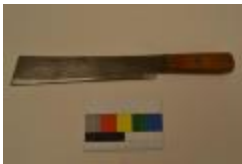
Knife (1998.16.7) February 27, 2013, 1930 – 1940