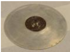
Wheel (2007.3.9.B) Angelo's Bakery