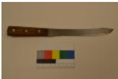
Knife (1998.16.6) February 27, 2013, 1930 – 1940