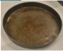
Mold, Cake (2007.3.18) Angelo's Bakery