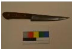
Knife (1998.16.5) February 27, 2013, 1930 – 1940