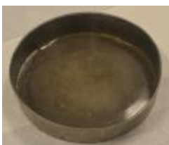
Mold, Cake (2007.3.17) Angelo's Bakery