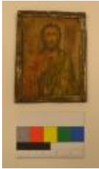
Icon (2006.18.2) circa 1800 – 1909,