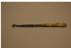
Buttonhook (2001.38.12) 1900, 1800 - 1900