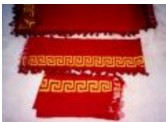
Drapery (2003.33.5.F) 1800s,