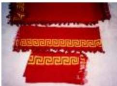
Drapery (2003.33.5.E) 1800s,