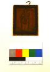
Icon (2006.18.1) circa 1800 – 1909,