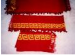
Drapery (2003.33.5.I) 1800s,