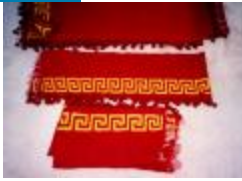
Drapery (2003.33.5.H) 1800s,