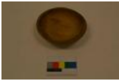
Mortar (1994.41.5A) 1800s,