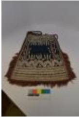
Apron (2005.5.14) 19th century,