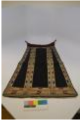
Apron (1993.61.1) 19th century,