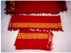
Drapery (2003.33.5.J) 1800s,