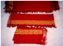
Drapery (2003.33.5.C) 1800s,