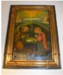
Icon (2015.2.2) 1800s,