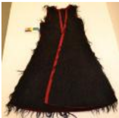
Vest (1994.35.2) 1800s,