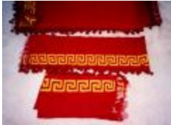
Drapery (2003.33.5.A) 1800s,