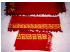
Drapery (2003.33.5.G) 1800s,