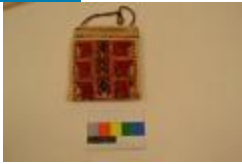
Bag (2003.33.22) 1800s, BARBATSULY