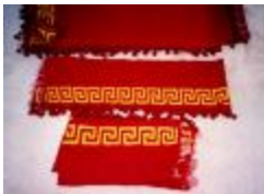
Drapery (2003.33.5.D) 1800s,