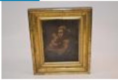
Icon (2015.2.1) 1800s,