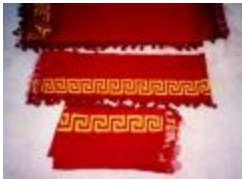
Drapery (2003.33.5.B) 1800s,