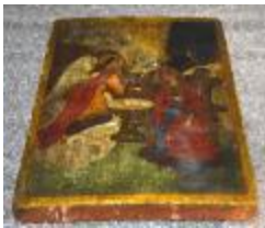
Icon (2006.18.3) circa 1800 – 1909,