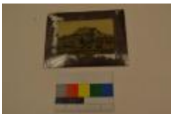
Postcard (2002.51.12.2) circa 1800,