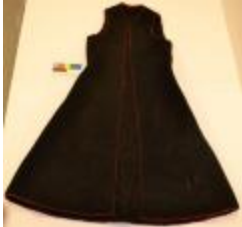
Vest (1994.35.1) 1800s,