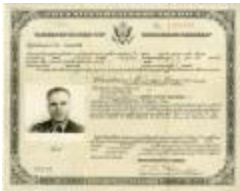
Certificate, Citizenship (2003.42.2.2) June 11, 1926