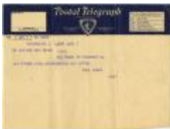
Telegram (2016.2.27) 1931 Economou Family Papers (NHM34)