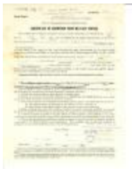
Certificate (1993.42.10A) August 17, 1917