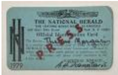
Card (2017.7.9) Theano Margaritis Collection