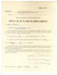
Orders, Military (1993.42.11A) August 2, 1917,