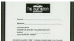
Card Store (2017.12.20) 1968 – 2016 The Parthenon Restaurant Collection