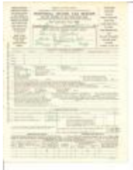
Return, Tax (1993.42.5) 1920,