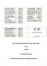
Menu (2017.12.33) 1968 – 2016 The Parthenon Restaurant Collection