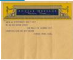
Telegram (2016.2.11) 1931 Economou Family Papers (NHM34)