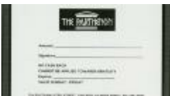
Card Store (2017.12.21) 1968 – 2016 The Parthenon Restaurant Collection