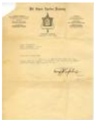
Letter (2001.1.13) 1936