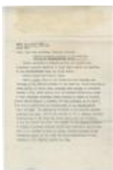
Photograph, Black-and-White (2018.8.2B) December 9, 1941