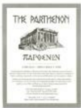
Menu (2017.12.29) 1968 – 2016 The Parthenon Restaurant Collection