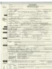
Certificate, Death (2016.2.17) 1993 Economou Family Papers (NHM34)