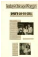
Clipping, Newspaper (2017.12.46) June 2001, The Parthenon Restaurant Collection