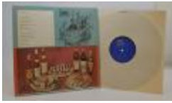
Record 33 1/3 RPM (2017.12.7) 1968 – 2016 The Parthenon Restaurant Collection