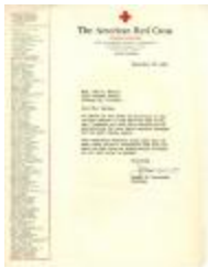
Letter (1995.19.8.10) September 28, 1960