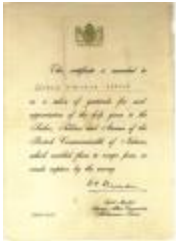
Certificate (1993.8.1) 1939 – 1945