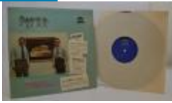
Record 33 1/3 RPM (2017.12.6) 1968 – 2016 The Parthenon Restaurant Collection