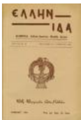
Book (2023.1.3) February 1956