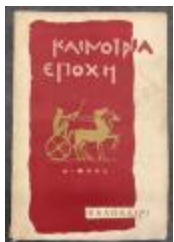
Book (2017.7.29)