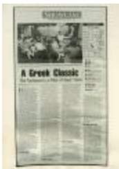
Clipping, Newspaper (2017.12.47) April 23, 1995, The Parthenon Restaurant Collection