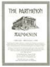
Menu (2017.12.28) 1968 – 2016 The Parthenon Restaurant Collection