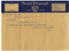
Telegram (2016.2.26) 1931 Economou Family Papers (NHM34)