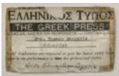
Card (2017.7.26)