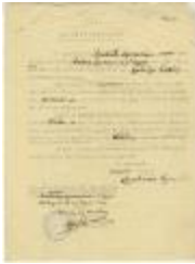
Document, Travel (2016.2.31c) 1926 Economou Family Papers (NHM34)