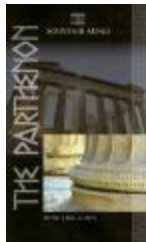
Menu (2017.12.11) 1968 – 2016 The Parthenon Restaurant Collection