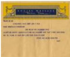
Telegram (2016.2.5) 1931 Economou Family Papers (NHM34)