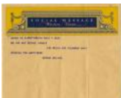
Telegram (2016.2.10) 1931 Economou Family Papers (NHM34)