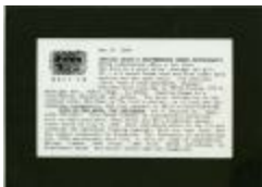
Review (2017.12.30) May 19, 1993, The Parthenon Restaurant Collection