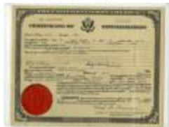
Certificate, Citizenship (2016.2.3) 1928 Economou Family Papers (NHM34)