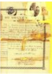
Photograph (2007.16.47.a) June 28, 1920,