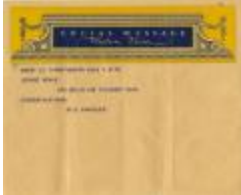
Telegram (2016.2.9) Economou Family Papers (NHM34)