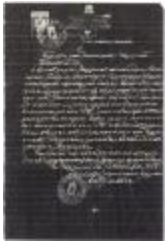
Certificate, Birth (1993.42.3) January 10, 1891,