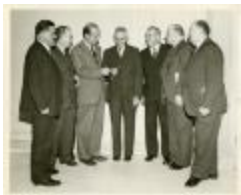
Photograph, Black-and-White (2018.8.2A) December 9, 1941