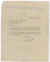
Letter (2018.8.1B) December 9, 1941