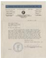
Letter (2018.8.1A) December 9, 1941 Lena Xydes Greek War Relief Association Photo Collection