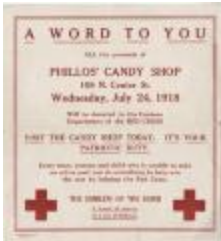
Ad, Magazine (2003.26.10) July 1918