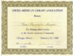
Certificate (2017.7.6) Theano Margaritis Collection