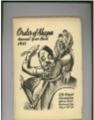
Archival Material (AR AHEPA Yearbooks) NHM Archives