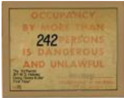
Sign (2017.12.45) 1992, The Parthenon Restaurant Collection