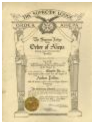
Certificate, Commemorative (2016.2.14) 1934 Economou Family Papers (NHM34)