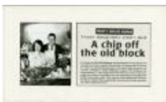
Clipping, Newspaper (2017.12.50) 1968 – 2016 The Parthenon Restaurant Collection