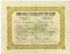
Certificate, Marriage (2016.2.29) 1931 Economou Family Papers (NHM34)