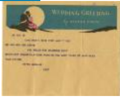
Telegram (2016.2.8) Economou Family Papers (NHM34)