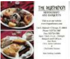
Card Business (2017.12.17) 1968 – 2016 The Parthenon Restaurant Collection