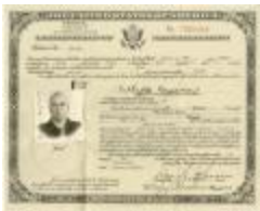
Certificate, Citizenship (2003.42.2.1) April 5, 1893