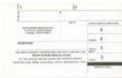
Receipt (2017.12.18) 1968 – 2016 The Parthenon Restaurant Collection