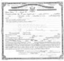
Certificate, Naturalization (1993.11.3) May 10, 1920,