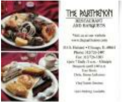
Card Business (2017.12.16) 1968 – 2016 The Parthenon Restaurant Collection