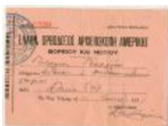
Bill of Sale (2016.2.30) 1931 Economou Family Papers (NHM34)