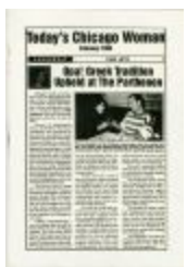
Clipping, Newspaper (2017.12.51) February 1994, The Parthenon Restaurant Collection