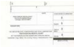
Receipt (2017.12.19) 1968 – 2016 The Parthenon Restaurant Collection