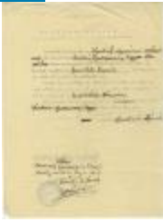
Document, Travel (2016.2.31b) 1926 Economou Family Papers (NHM34)