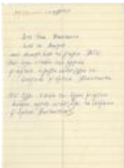
Poem (2016.2.32) 1975 Economou Family Papers (NHM34)