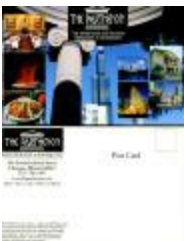
Postcard (2017.12.13) 1968 – 2016 The Parthenon Restaurant Collection