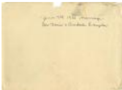
Envelope (2016.2.22) 1931 Economou Family Papers (NHM34)