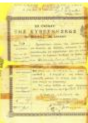
Photograph (2007.16.47.b) June 28, 1920,