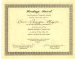
Certificate (2017.7.7) Theano Margaritis Collection