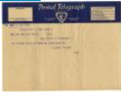
Telegram (2016.2.25) 1931 Economou Family Papers (NHM34)