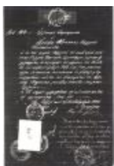
Certificate, Birth (1993.42.2) November 26, 1926,