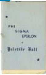
Pamphlet (2001.1.6) 1940