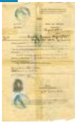
Record, Immigration (2019.13.1) August 25, 1929