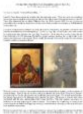
Article (2022.8.1) James D. Tanos Collection