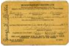
Certificate (1993.42.20) April 27, 1942,