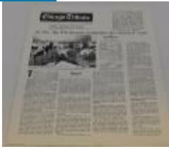
Clipping, Newspaper (2017.12.44) October 29, 1993, The Parthenon Restaurant Collection