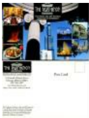
Postcard (2017.12.12) 1968 – 2016 The Parthenon Restaurant Collection