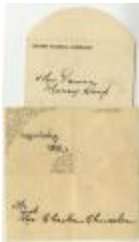
Letter (2016.2.21) Economou Family Papers (NHM34)