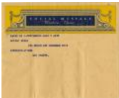
Telegram (2016.2.7) 1931 Economou Family Papers (NHM34)