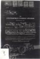
Discharge, Military (1993.42.1) January 9, 1926