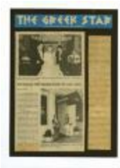
Clipping, Newspaper (2017.12.49) 1998, The Parthenon Restaurant Collection