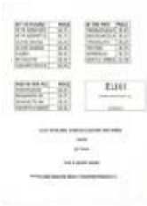
Menu (2017.12.32) 1968 – 2016 The Parthenon Restaurant Collection