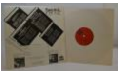
Record 33 1/3 RPM (2017.12.9) 1968 – 2016 The Parthenon Restaurant Collection