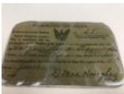
Registration (1993.42.19) June 5, 1917