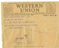
Telegram (2016.2.24) 1931 Economou Family Papers (NHM34)