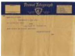
Telegram (2016.2.13) 1931 Economou Family Papers (NHM34)