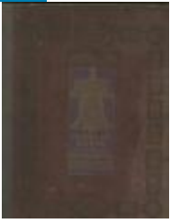
Archival Material (AR AHEPA Con Books) NHM Archives