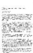
Memoir (2024.10.1) January 29, 1999