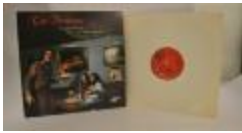
Record 33 1/3 RPM (2017.12.8) 1968 – 2016 The Parthenon Restaurant Collection