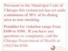
Sign (2017.12.39) 1968 – 2016 The Parthenon Restaurant Collection