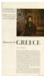
Magazine (2023.1.1) December 1961