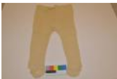
Legging (1994.41.11.E) February 15, 2013, 1926 Marina Textile Collection