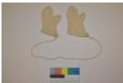
Mitten (1994.41.11.F) February 15, 2013, 1926 Marina Textile Collection