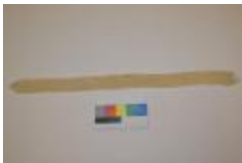
Belt (1994.41.11.D) February 15, 2013, 1926 Marina Textile Collection