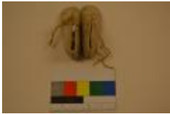
Bootee (1994.41.11.A) February 15, 2013, 1926 Marina Textile Collection