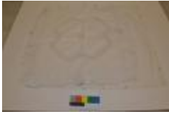
Pillowcase (1994.41.10.C) February 15, 2013, 1910 Marina Textile Collection