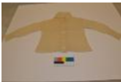
Jacket (1994.41.11.C) February 15, 2013, 1926 Marina Textile Collection