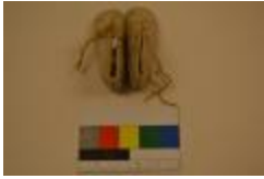
Bootee (1994.41.11.B) February 15, 2013, 1926 Marina Textile Collection