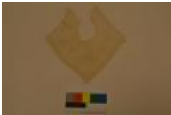
Bib (1994.41.3.E) February 15, 2013, 1927 Marina Textile Collection