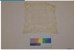
Handkerchief (1994.41.9 B) February 15, 2013, 1920–1940 Marina Textile Collection