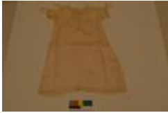
Gown, Baptismal (1994.41.3.A) 1927, 1924 Marina Textile Collection