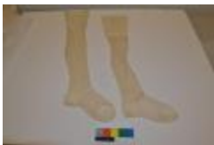
Stocking (1994.41.7.B) February 15, 2013, 1920s Marina Textile Collection