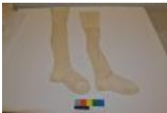
Stocking (1994.41.7.A) February 15, 2013, 1920s Marina Textile Collection