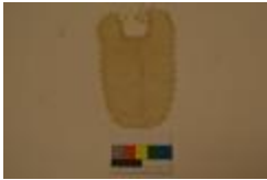
Bib (1994.41.3.C) February 15, 2013, 1924 Marina Textile Collection