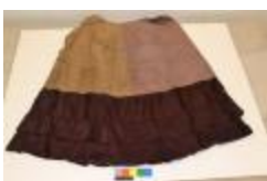
Petticoat (1994.41.12.A) February 18, 2013, 1880 - 1930 Marina Textile Collection