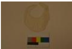
Bib (1994.41.3.F) 1927, 1927 Marina Textile Collection