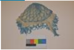
Cap (1994.41.12.B) February 18, 2013; Marina Textile Collection