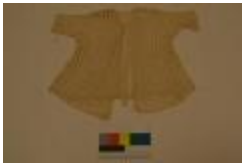
Gown, Baptismal (1994.41.3.B) February 15, 2013, 1927 Marina Textile Collection