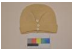
Cap (1994.41.11.G) February 15, 2013, 1926 Marina Textile Collection